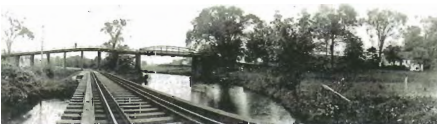
On the Waterbury extension near Cheshire Street station.

The State Railroad Commission's report for the year ending December 31, 1887, stated that approval of the location of the line was given June 30th, that its length would be 18.84 miles, "of which 11.6 miles are completed. It crosses the New Haven & Northampton and the Naugatuck divisions of the New York, New Haven & Hartford, being carried over them. It crosses 38 streets and highways, of which it was desired to cross 16 at grade, and the town authorities united with the railroad in urging that it be allowed. In view of the requirements of the law, we did feel justified in permitting any at grade." This of course added considerably to the cost of building the railroad.