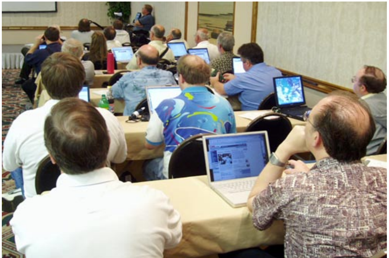
Laptops galore at the DCC.

The talk was an introduction to APRS. It started off with some cool uses I had put it to and then worked through the basics. Some of this, I admit, was a bit out of order, but it was good. People were asking the right questions. Having Internet access there was cute. I could demo some of the Internet services available.